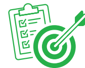
Chart of Accounts

Grows each time you need to add a new account or fund.